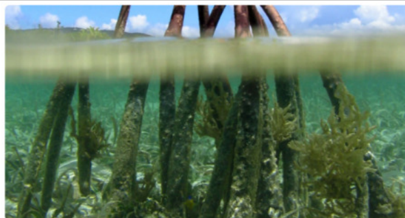
Underwater shot of roots