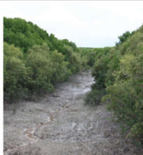
Comparison at high (left) tide and low tide (right)