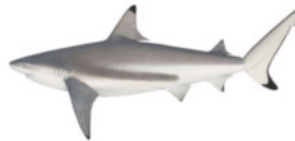
Blacktip reef shark