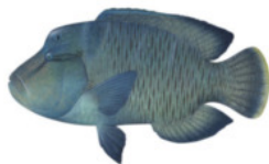
Humphead Maori wrasse