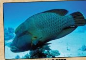
HUMPHEAD MAORI WRASSE