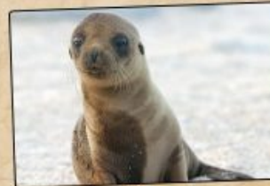
SEALS AND SEALIONS