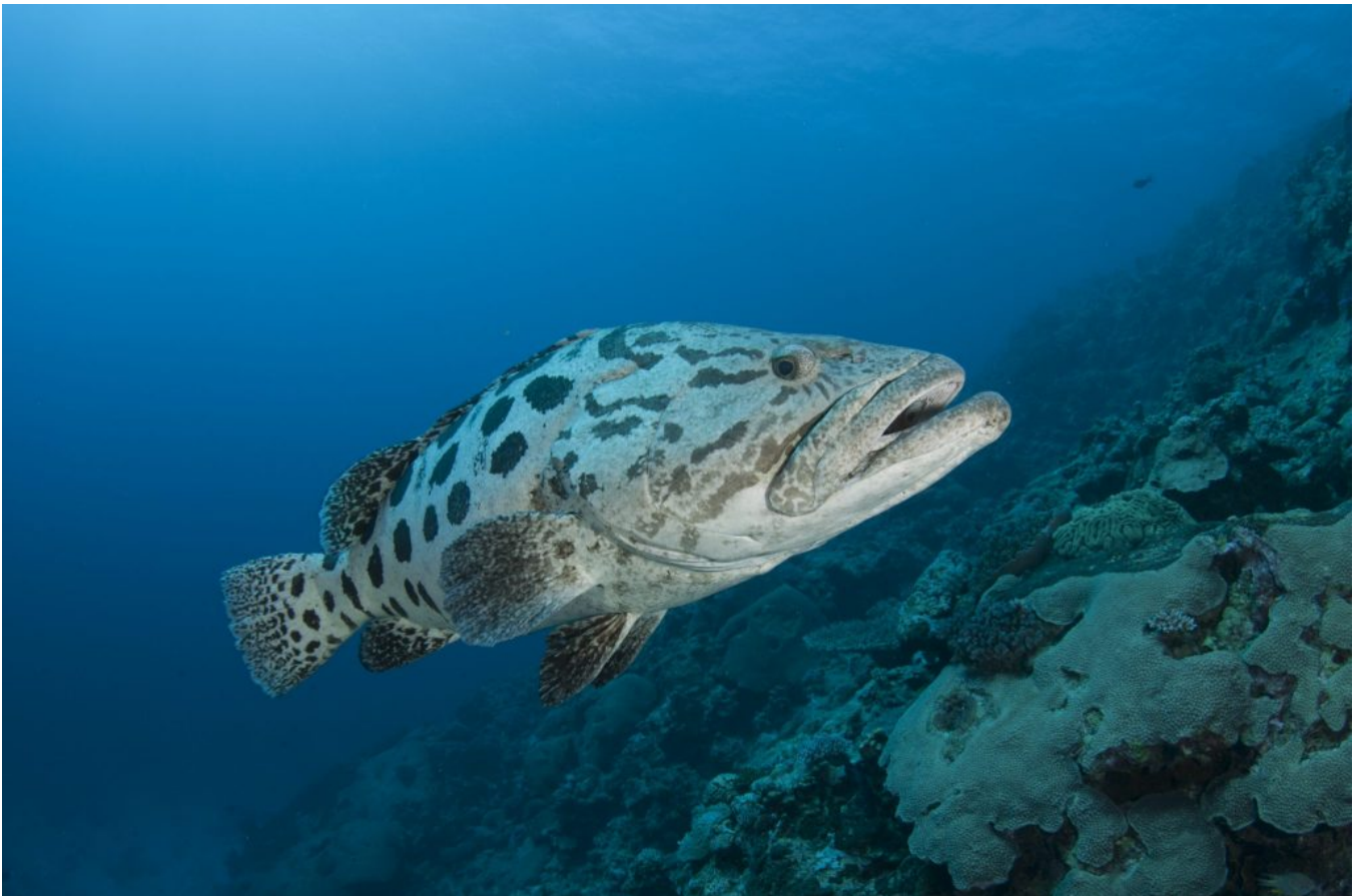
Figure 1. Potato cod

The captivating potato cod is truly a giant of the fish kingdom. Its massive size and homebody nature draws divers who are looking for a story to tell about their underwater adventure.