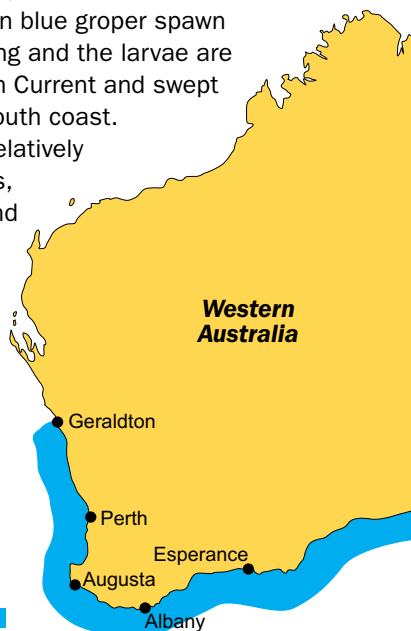
Range of western blue groper in WA

The western blue groper is found all the way from Geraldton down the west coast and almost as far east as Melbourne, in waters from five to 65 metres deep. Western blue groper spawn between winter and spring and the larvae are caught up in the Leeuwin Current and swept eastwards along WA's south coast. Juveniles often inhabit relatively shallow protected waters, such as inshore reefs and seagrass meadows. As blue groper get older, they tend to venture into deeper water around offshore reefs.