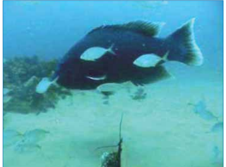
The western blue groper has few natural predators once fully grown.

For a slow-growing species such as western blue groper that has few natural predators once fully grown, important signals that populations are being overfished may include a decrease in the maximum age of fish and in the proportion of older fish being sampled/caught.