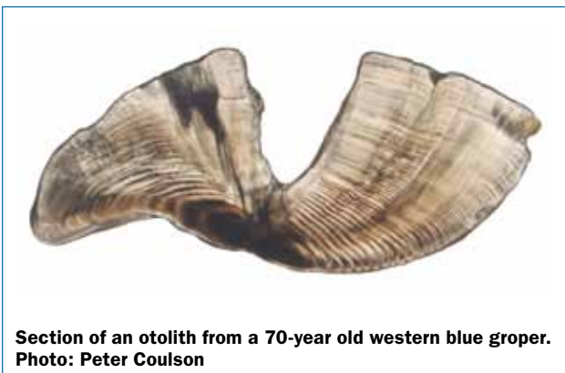
Section of an otolith from a 70-year old western blue groper.

The otoliths, used by fish to balance and hear underwater, lay down growth rings every year in a similar manner to tree trunks. Researchers count the growth rings to build a picture of the abundance of each 'age class' in the population of a fishery. This information is used to gain an understanding of the impact of fishing on the stocks of species.