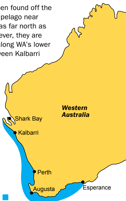
Range of West Australian dhufish

Dhufish have been found off the Recherche Archipelago near Esperance and as far north as Shark Bay. However, they are most common along WA's lower west coast between Kalbarri and Augusta.