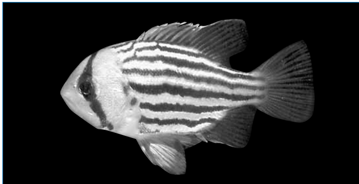
A three-month-old juvenile dhufish measuring just over three centimetres.

Adult dhufish have a distinctive vertical dark line called a chevron running through their eye that fades once they die and which is also fainter on females. Juvenile dhufies have black stripes along their body.