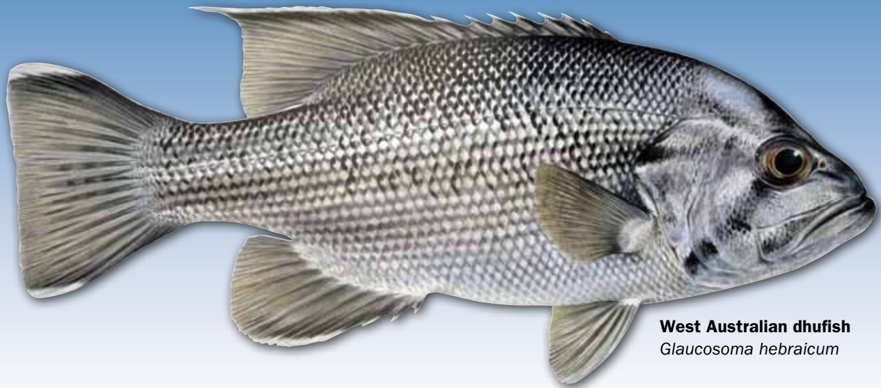
West Australian dhufish Glaucosoma hebraicum