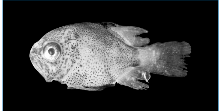
A 33-day-old larval dhufish measuring less than one centimetre long.

'Recruitment' is a term used by researchers to describe the natural addition of fish to a population, either by reproduction or migration. While it sometimes refers simply to young fish joining a population, in some contexts it may instead refer to fish of legal size entering a fishery.