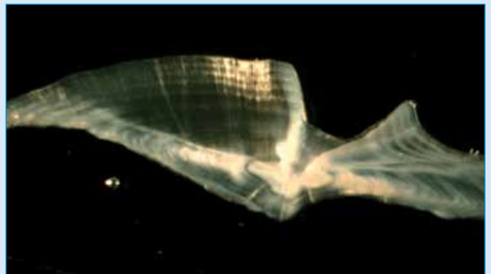
Section of a dhufish otolith.

Researchers extract the otoliths and cut thin sections from them using a high-precision saw. Under magnification, the alternating white and translucent bands can be seen and counted. This is done to thousands of fish otoliths in Department of Fisheries' research laboratories each year.