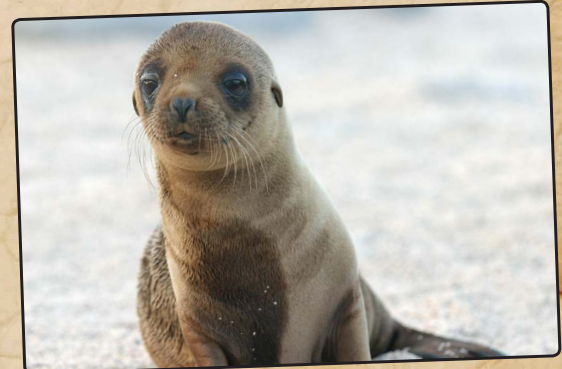
SEALS AND SEALIONS